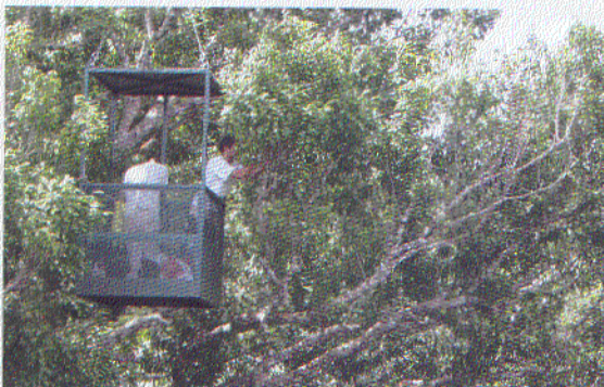
Fig. 4. Sampling ants from the foliage using the crane's gondola.

IBISCA is sited within the tropical wet evergreen forest of the San Lorenzo Protected Area, Colón Province, and concentrates on 8 sites where a 20 x 20m quadrat of vegetation has been surveyed. The project employs state-of-the-art methods of canopy access and sampling, namely canopy raft and peripherals (the Solvin 'Bretzel': www.radeau-des-cimes.org/03/panama.htm ), canopy crane (see picture), single rope techniques and canopy 'fogging'. These techniques complement each other for the entomological study of the rainforest canopy, and this project represents the first attempt to combine them in a large-scale study (Roslin 2003). The project IBISCA, co-ordinated by the second author, includes three major stages: spatial replication, mostly achieved by the raft peripherals and single rope techniques (September - October 2003); seasonal replication, mostly performed at the crane site (February, May and October 2004); and analytical workshop and dissemination of early results (2005). Prof. E.O. Wilson, Harvard University, is the official patron of IBISCA 2003-2005.