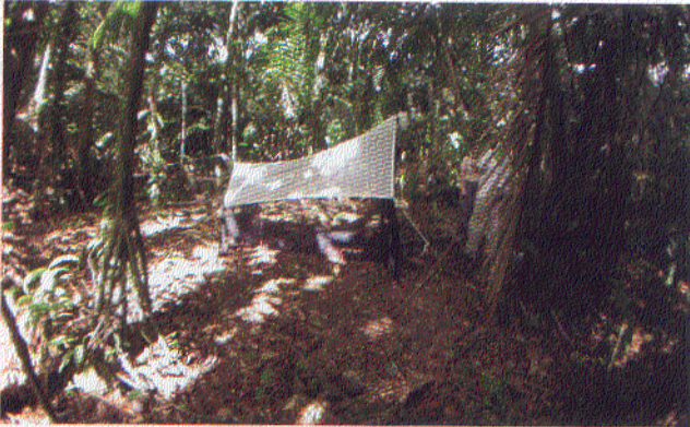
Fig. 1. A Malaise trap emplaced at one of the IBISCA sites.

Fig. 2. Vertical distribution (mean no. of individuals per trap \pm 1 s.e.) of various groups well-represented in sticky traps samples at six of the nine study sites in San Lorenzo. Dolichopodidae = flies, predators; Psylloidea = bugs, herbivores; Phoridae = flies, mostly scavengers; Scolytinae = beetles, mostly wood-eaters. Number of traps surveyed: litter (0m), n = 15 ; understorey (1.3m), n = 165 ; canopy (1.3–35m), n = 53 ; upper canopy (> 35m), n = 152 .