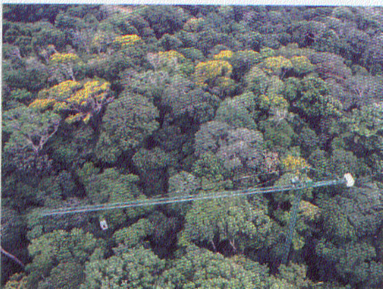
Fig. 3. The San Lorenzo canopy crane.